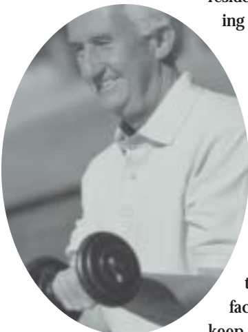
Strengthening exercises help improve residents' quality of life.

(preparing to move her mother in to Eden Pines Petersburg)